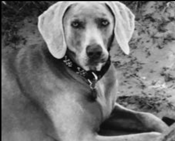
MOLLY in Wyoming