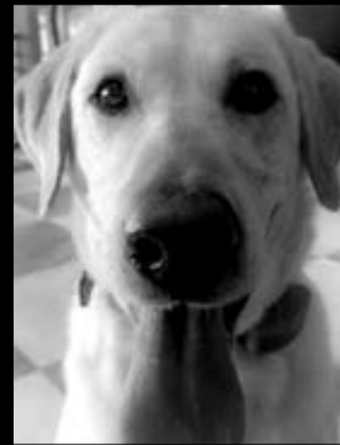
KASEY in Idaho

M-44 "CYANIDE BOMBS" ARE KILLERS THAT NEED TO GO