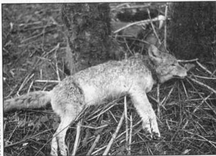
Strangled in neck snare, this coyote was one of many drawn to a heap of rotting wild animal carcasses purposely placed by Wildlife Services. Pets were also imperiled by their attraction to the area.