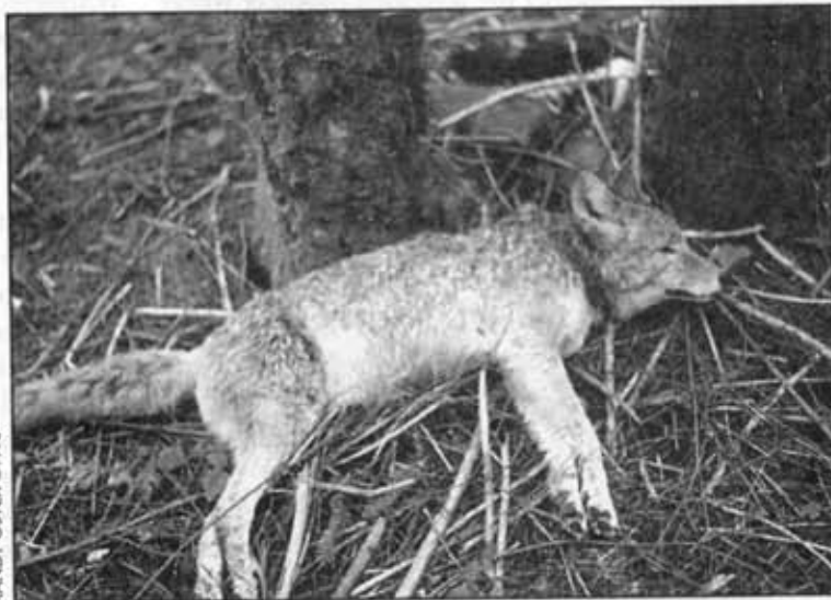
Strangled in neck snare, this coyote was one of many drawn to a heap of rotting wild animal carcasses purposely placed by Wildlife Services. Pets were also imperiled by their attraction to the area.

When the neighbors in our immediate community heard what was going on, many of them came out in our support. We found out most had lost dogs and were opposed to the trapping and methods used by Wildlife Services. Fortunately, they were willing to help, with us leading the charge,